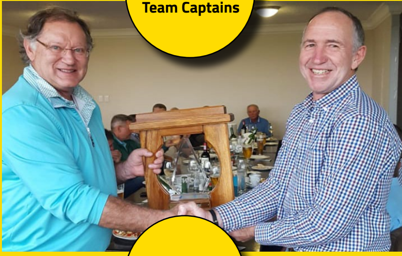
Jukskei Trophy Winners Team Captains